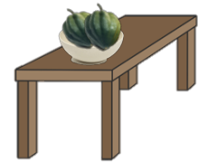
Counter away from sun