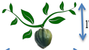
Average plant size